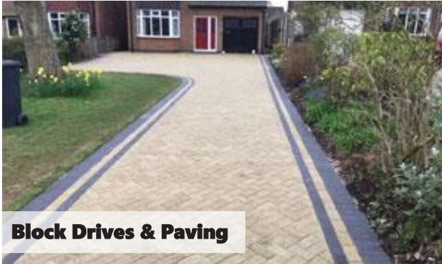
Block Drives & Paving