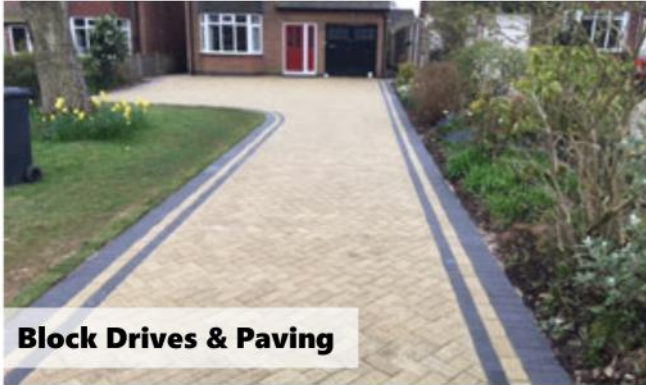
Block Drives & Paving